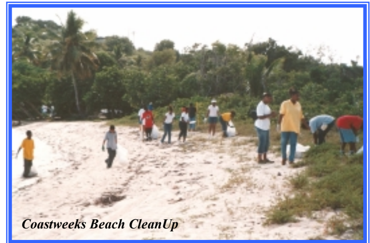
Coastweeks Beach CleanUp

Increase the involvement and commitment of citizens and affected interests in efforts to protect and restore coastal water quality and coastal resources.