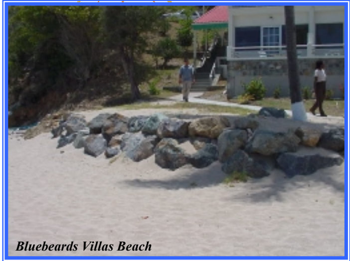
Bluebeards Villas Beach

Provide clear, easily accessible information and guidance to permit applicants and other interested parties. Establish a productive work force by exploring and providing opportunities for technical training. Enhance permitting program through the use and implementation of related technology and tools.