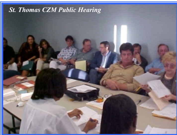
St. Thomas CZM Public Hearing

Promote the management our coastal resources for the future by the development of three goals. These objectives are to provide information; to raise and enhance public awareness and interest; and to encourage positive action.