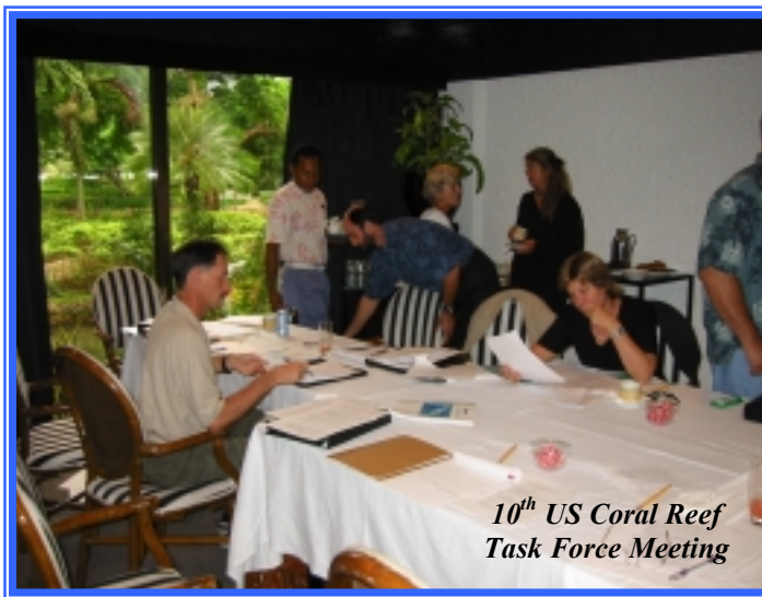
10 th US Coral Reef Task Force Meeting

Encourage and provide affordable and diverse public recreational opportunities in the Coastal Zone for all residents of the Virgin Islands through the acquisition, development, and restoration of areas consistent with sound resource conservation principles.